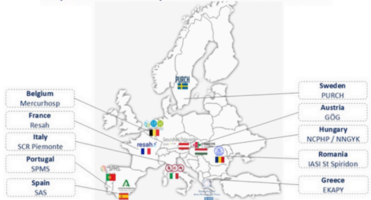
Map of the 10 Country Leaders involved in PROCURE

The results of the Observational Study, alongside the forthcoming Digital Statistical Tool developed by UPM called EU Contract Hub, are expected to shape these initiatives, helping Europe’s healthcare systems prepare for the future with a strong, unified procurement strategy.